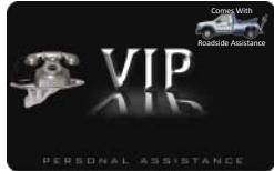
VIP Cards Can Include The Wrecker Icon