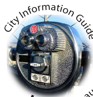
City Information Guide