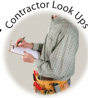
Contractor Look Ups

With Home Personal Concierge, Your Clients Are Always Just One Call Away From Getting Anything, Anywhere, Anytime