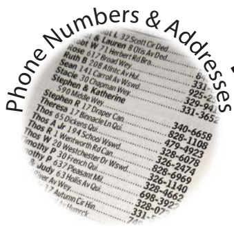
Phone Numbers & Addresses