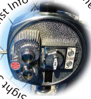
Sight Seeing/Tourist Info