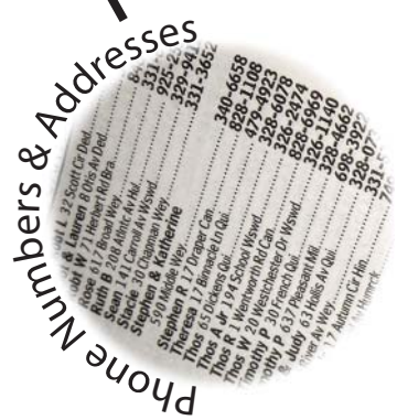
Phone Numbers & Addresses